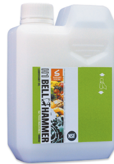
H1 BELL HAMMER Stock liquid (1000ml) undiluted liquid