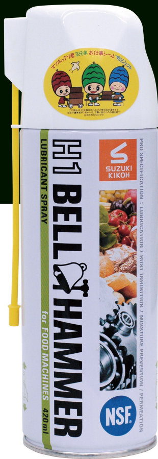
H1 BELL HAMMER SPLAY (420ml)