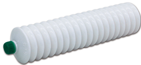
H1 BELL HAMMER CARTRIDGE GREASE No.2

Please use appropriate amount applied to a variety of food manufacturing Machinery and production line.